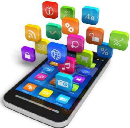
Mobile Application Development View Portfolio