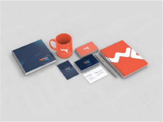
Corporate Branding View Portfolio