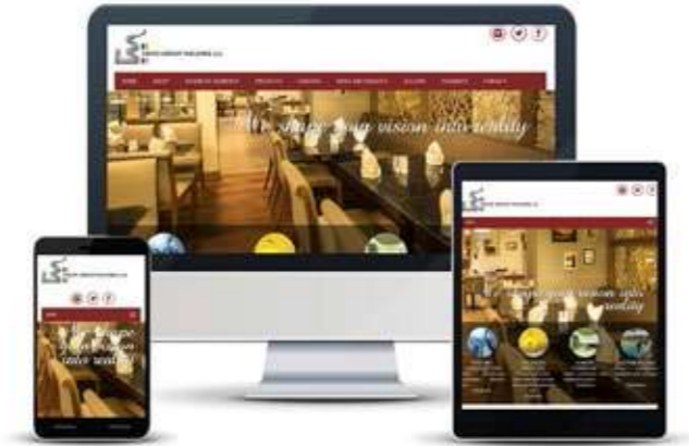
Website Designing View Portfolio