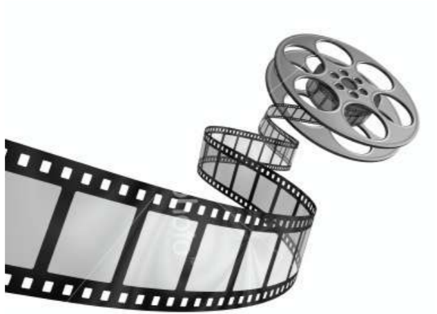
Corporate Films View Portfolio