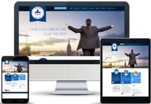
Sital Group http://www.sitalgroup.com/