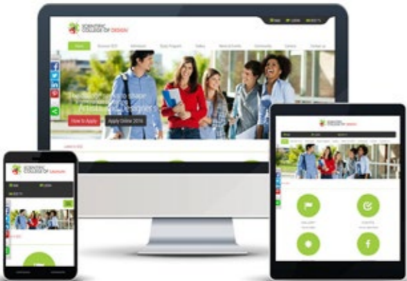
Scientific College of Design http://scd.edu.om/