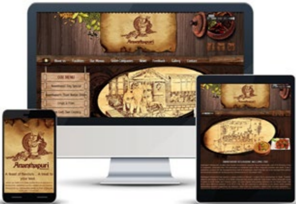
Ananthapuri Restaurant http://ananthapurimuscat.com/