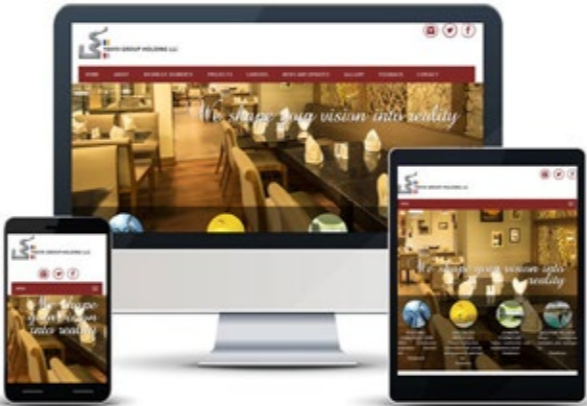
Yahya Group of Holdings LLC http://yahyacon.com/