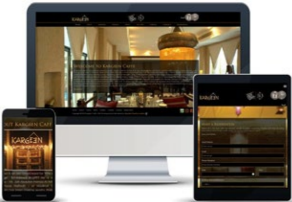
Kargeen Caffe http://kargeencaffe.com/