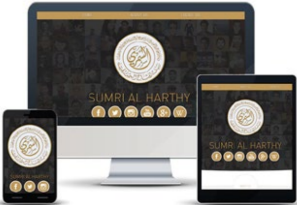
Al Harthy Global LLC http://www.sumrialharthy.com/